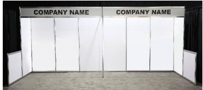
20' x 10' Hardwall Package: