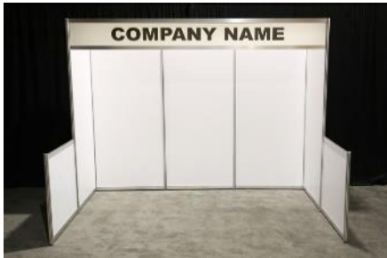
10' x 10' Hardwall Package: